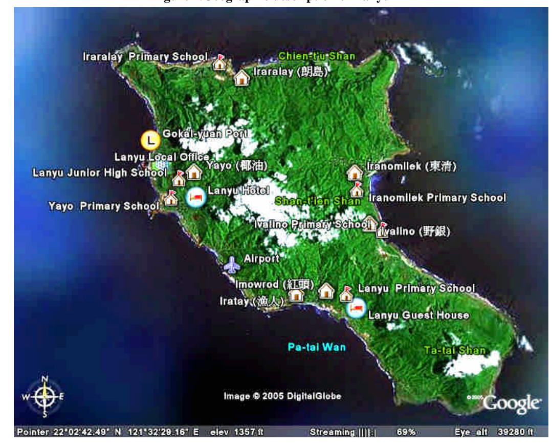
Figure 2.Geographic description of Lanyu

In and near Imowrod are the airport, post office, clinic, and a hotel. Right across Imowrod at the opposite side of the island is Ivalino, where the Lanyu Nuclear Waste Plant is located. The administrative center of the island is at Yayo, where a hotel and a secondary school can be found. Iraralay and Iranomilek are further away from the government offices and tend to better preserve the Yami language. However, all villages have primary schools with Mandarin Chinese as the only medium of education. Recently, with the development of tourism, an increasing number of remodeled homes have been opened for room and board for tourists, especially on the more scenic beach on the northeast coast.